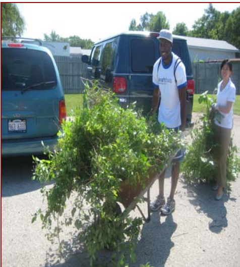
Volunteers from Kraft Foods helping with yard clean up at our Transitional Housing site in Zion.

Volunteers are always needed, whether it is helping in the Food Pantry or working on Transitional Housing projects. If you would like to be a volunteer, please contact Amber Abbott, the Volunteer Coordinator, at 847-662-1230.